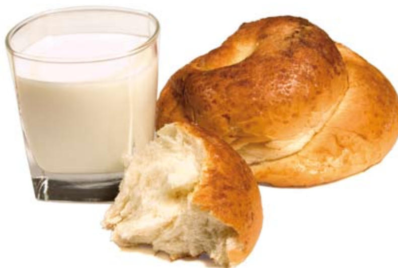
Cereal and dairy industries to benefit if CRC bids successful

The cereal and dairy industries could soon benefit from having their own CRCs, after the MPBCRC Board announced that two new CRC bids will be put forward for the upcoming funding round.