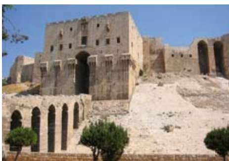
Ancient Citadel at Aleppo, Syria